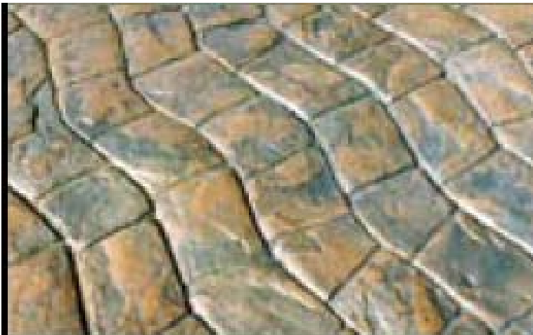
FM-1300 Serpentine Stone

A wavy pattern of slate tiles with a hand-chiseled look