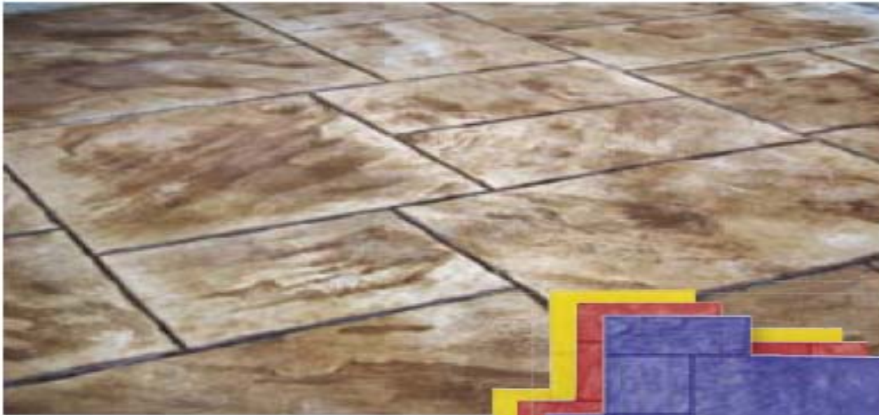
Regal Ashlar (Blue Stone) FM-3650 S/O 36" x 36" (91.44 x 91.44 cm) Red, Yellow, and Blue Blue stone textured tiles, with worn beveled edges, arranged in an ashlar pattern

Stone textured tiles with worn beveled edges, arranged in an Ashlar pattern